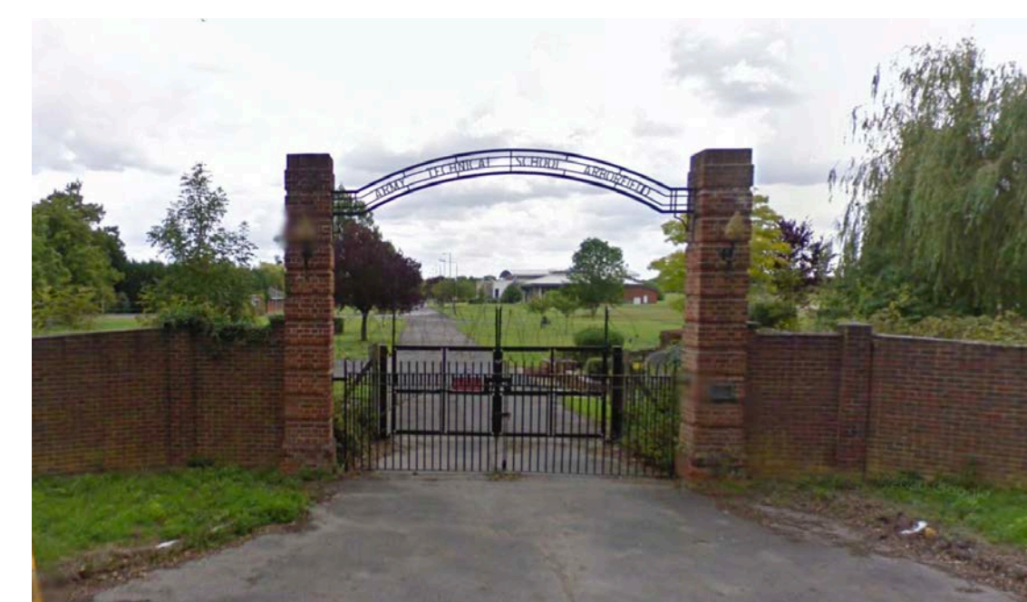
Existing gates to be relocated into District Centre